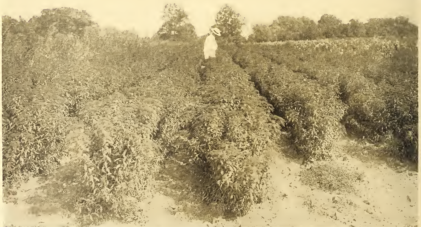
Some very good Spiraea Anthony Watereri; this block, two years in the nursery, will run 90% in plants 2 to 2½ ft. high and average 12 to 16 branches.